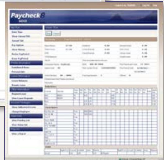
T & A Summary