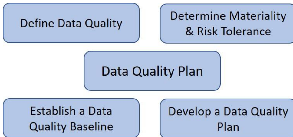
Data Quality Framework Table

Each of these cornerstones is detailed further in this section.